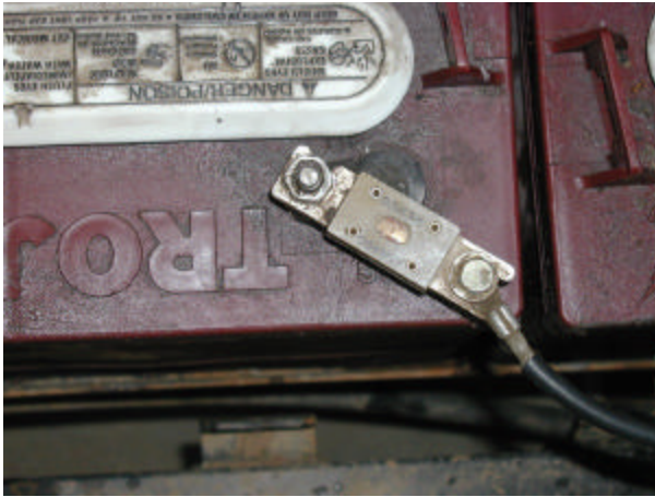
Example 1: On Battery